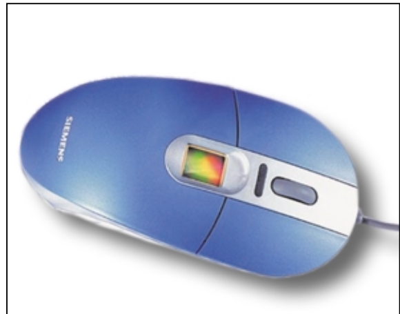
Siemens ID mouse: Used with realtime's software

The newest software solution from realtime, bioPortal, extends the security of